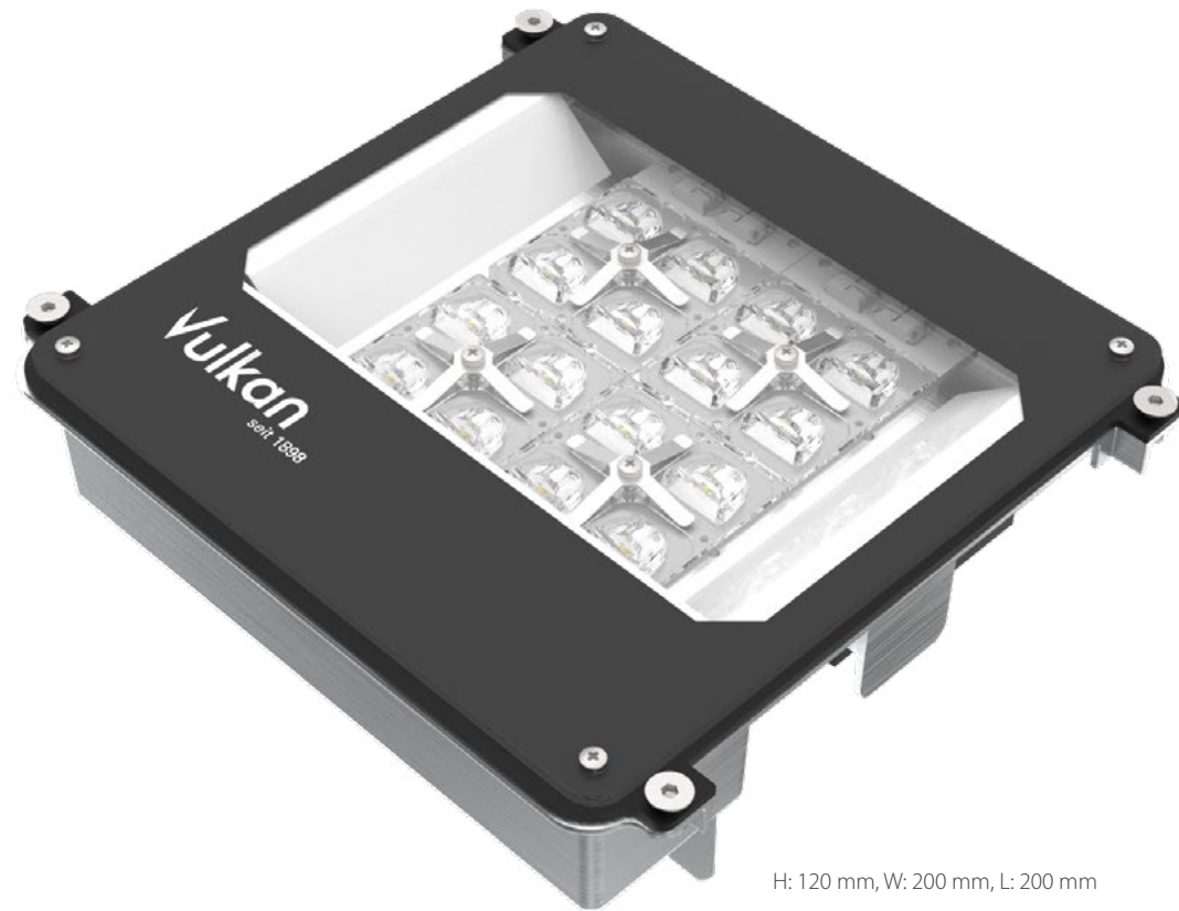
H: 120 mm, W: 200 mm, L: 200 mm